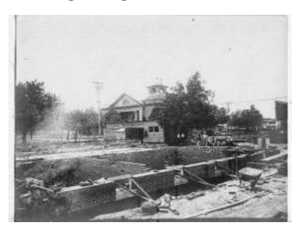
Looking Southwest on Park Street, the First Methodist Church is in the background