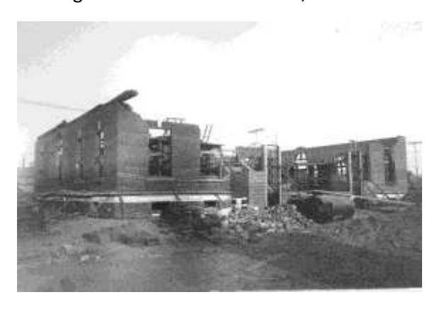
Erecting the brick walls