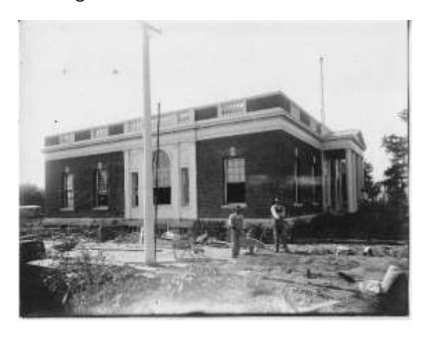
Completed in 1918 and served as the post office until 1971